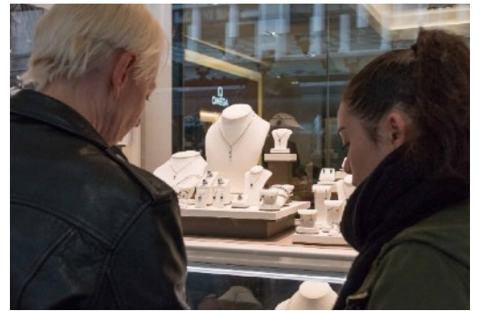
Oh dear, two girls and a jewellery store.....