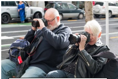
Wonder who took theirs