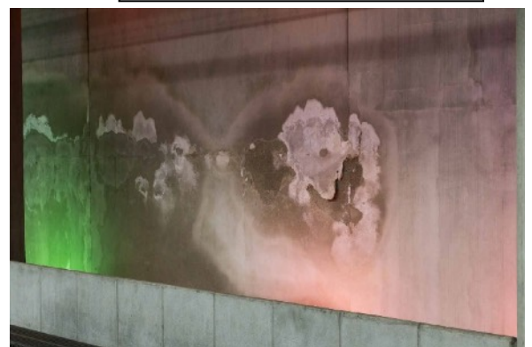
Found the face on the wall. Complete with