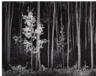
Aspens, New Mexico 1958 Ansel Adams

What: Black & White Workshop When: Saturday 12 th August 2017 Where: Patumahoe Bowling Club Time: 10.00 am - 2.30pm Cost: $20 for club members $30 non club members