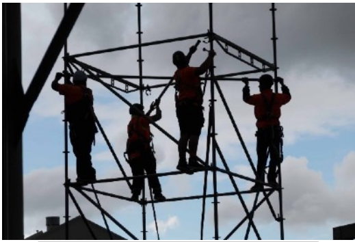
Scaffolders on Queens Wharf - my fav shot of the day