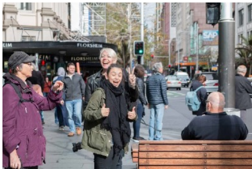
Crazies at the crossing