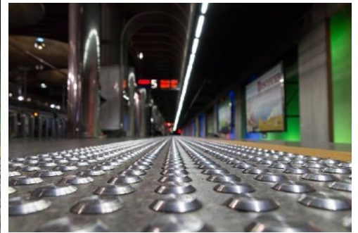
Abstract fun at Britomart

We also had the Basic Post Processing workshop follow up, hopefully those that went got some more tips and tricks, look forward to seeing their work and putting those skills into action!