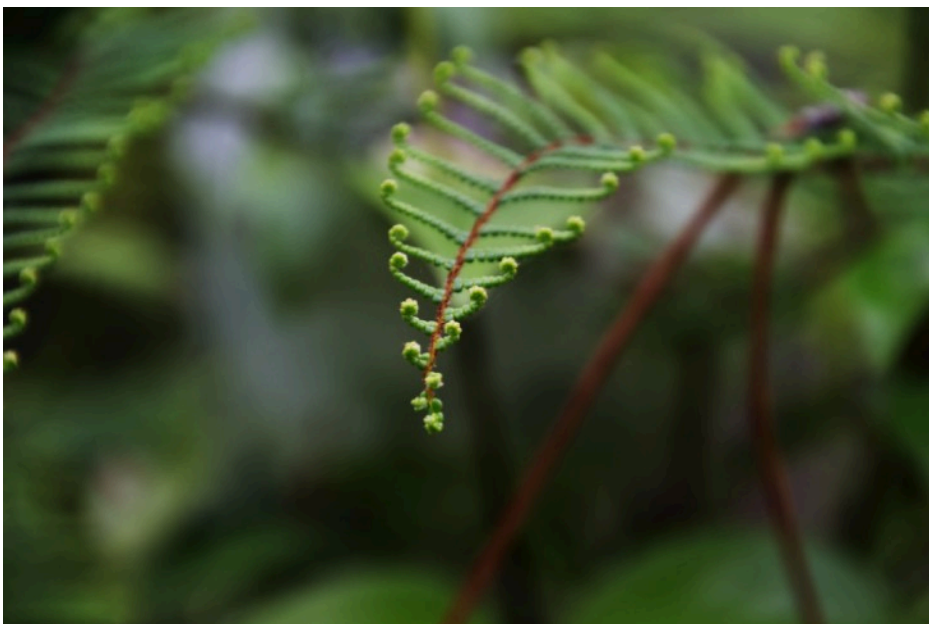
'Fern with legs'