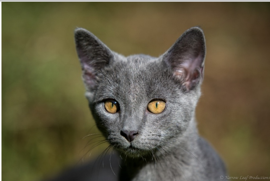
Gandalf the Grey

Nikon D7100 Tamron f2.8 70-200 1/6400 - f2.8 - ISO 320 @ 200mm