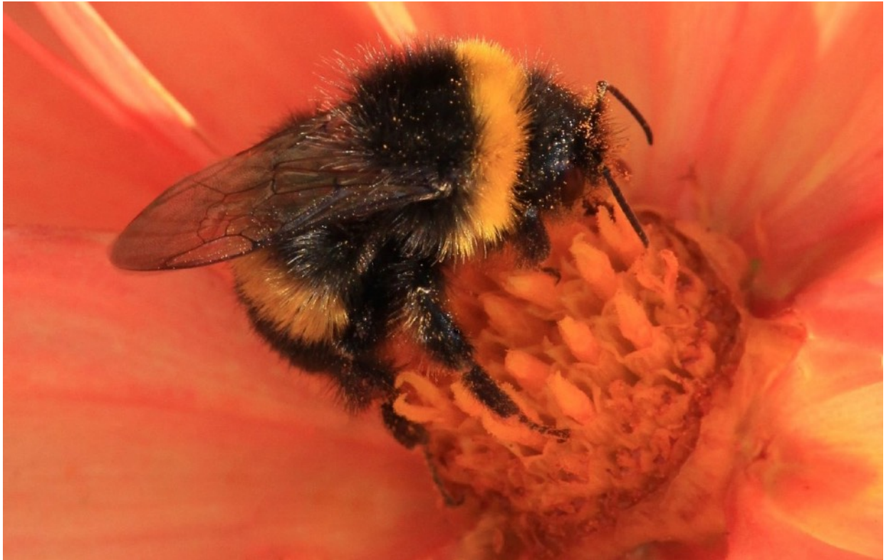
'Busy Bumble' Diane Todd