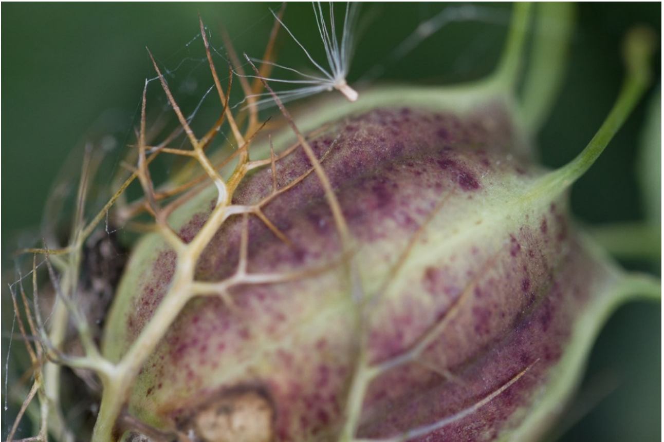
'Love in a mist seed pod'