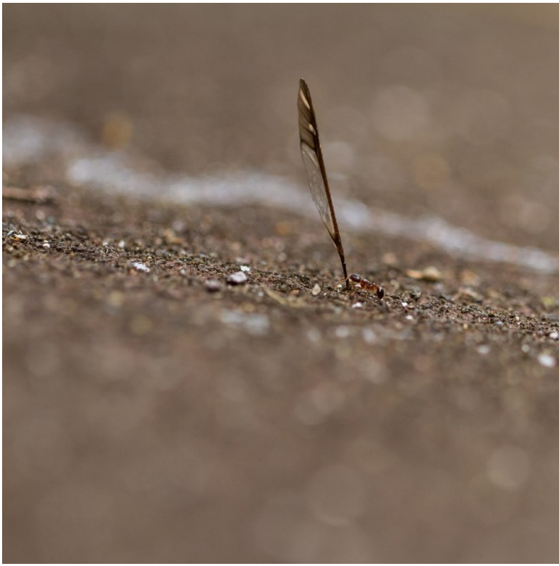
'Natures Land Yacht'