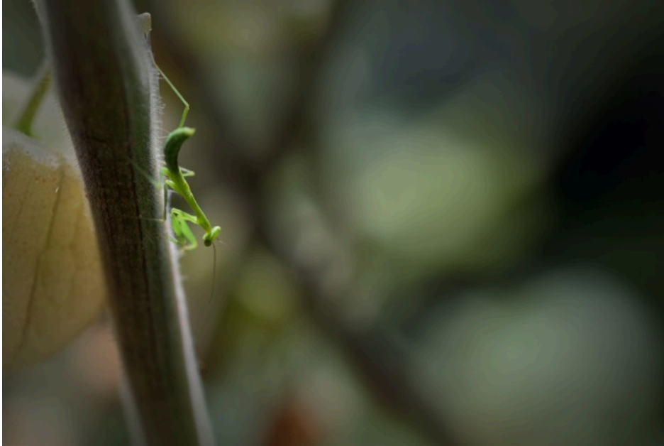
'Baby Praying Mantis'