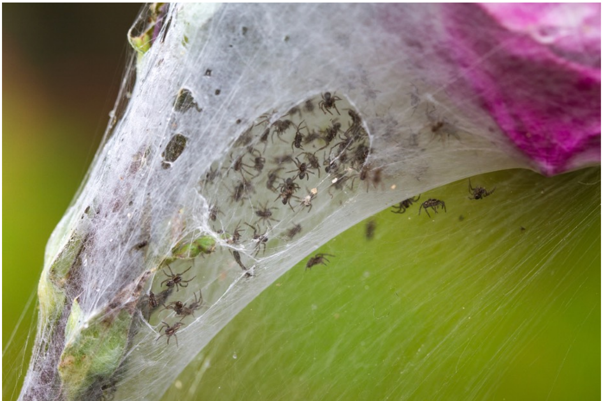
'Nursery Web Spiders'