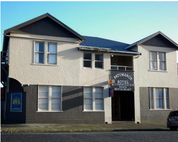
Patty Hotel By Amy Shepherd