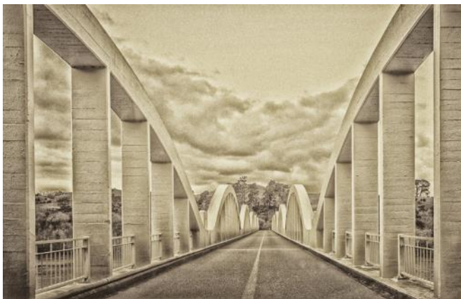
Over The River By Bev McIntyre