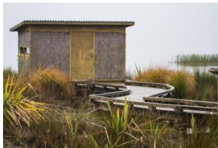
Shelter from the rain