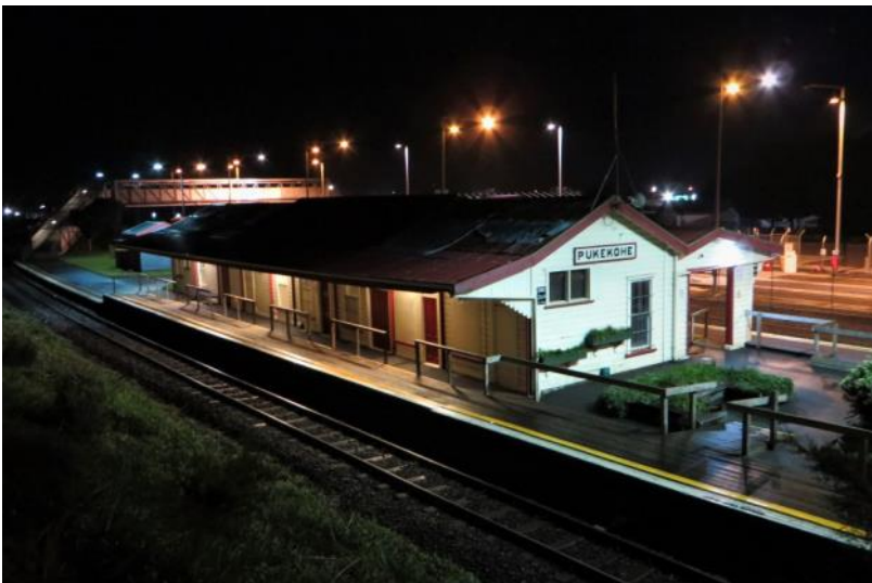
Pukekohe Train Station