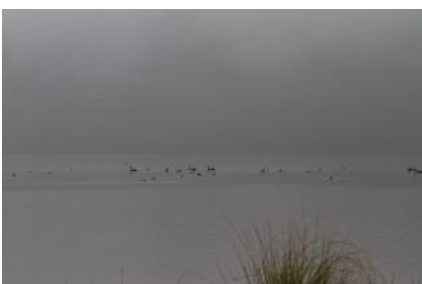
The birds were not flying