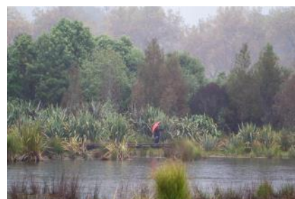
Lynn, far away as usual