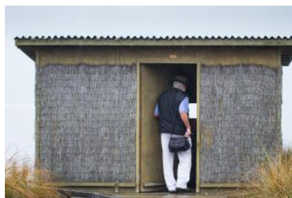
Entering the Tardis