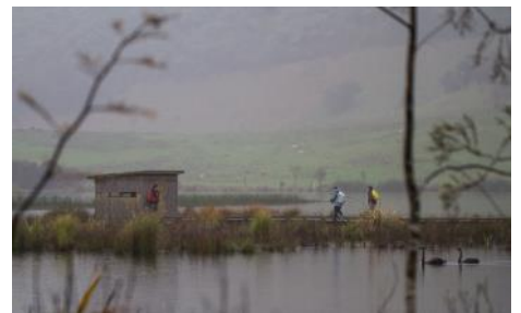
Heading for the hide