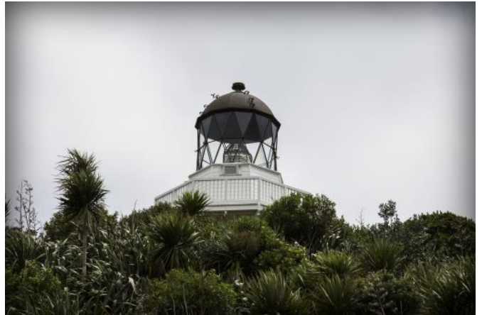
The House of Light By Robyn Wilkinson