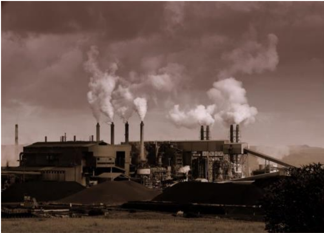
Sand To Steel