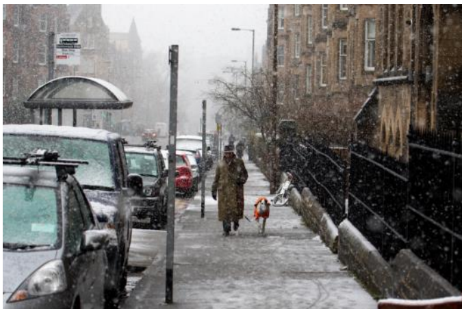
Walking The Dog