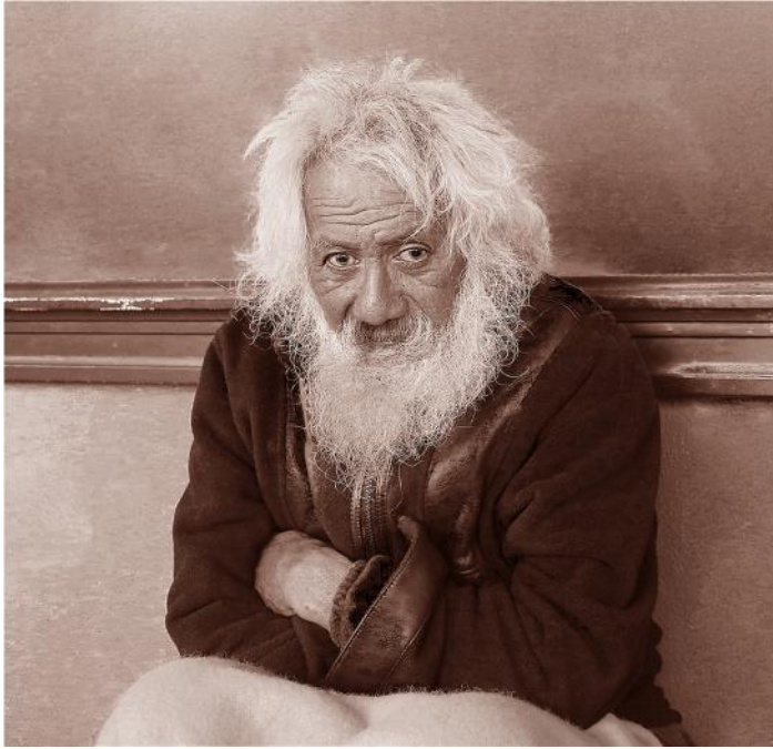
The Face Of Despair