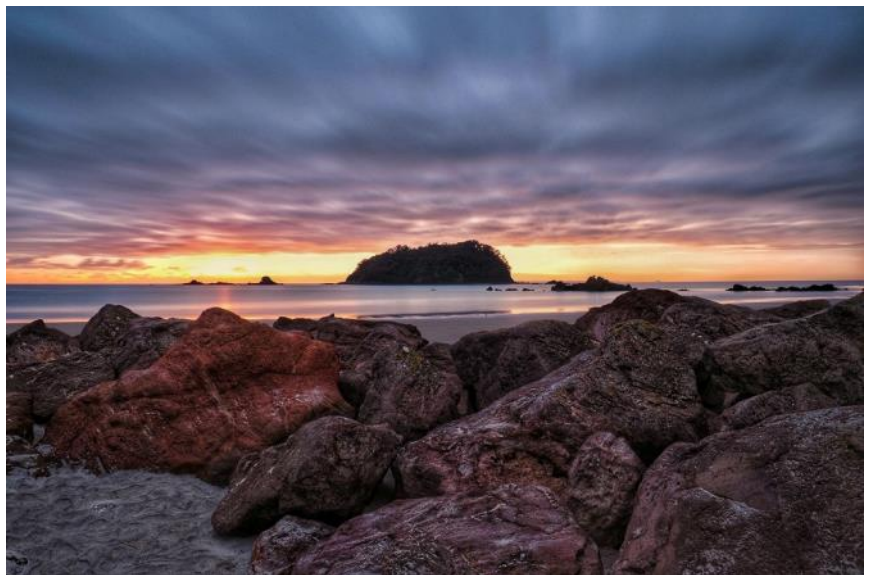
Motuatau Island Sunrise