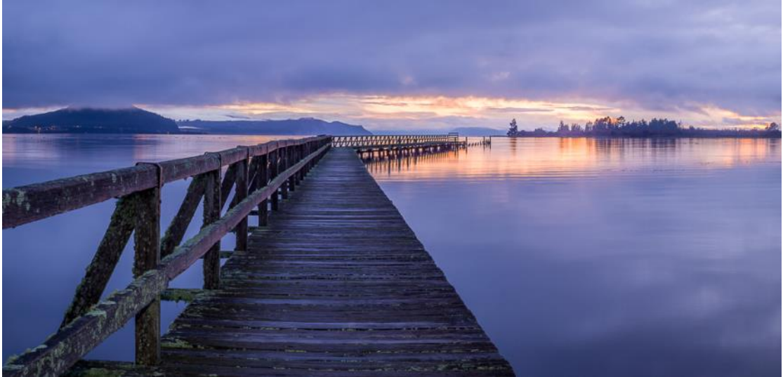
Tokaanu Wharf