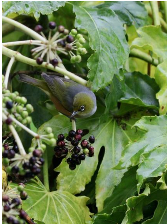
A Juicy Treat