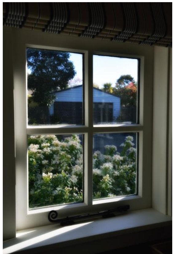
Country Cottage Window By Sandy Campbell