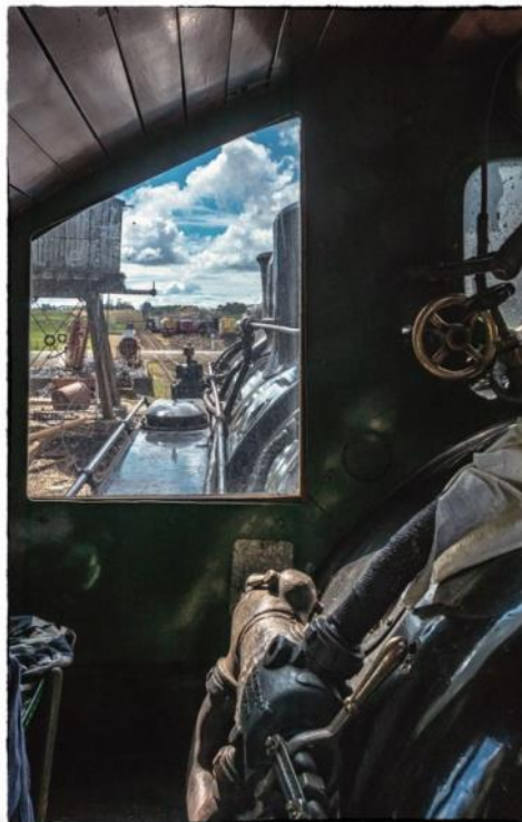
Lookin' Down The Track