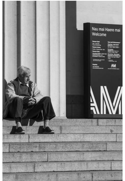
Museum Man By Robyn Wilkinson