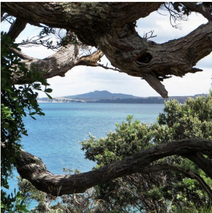
Rangitoto By Raewyn Lane