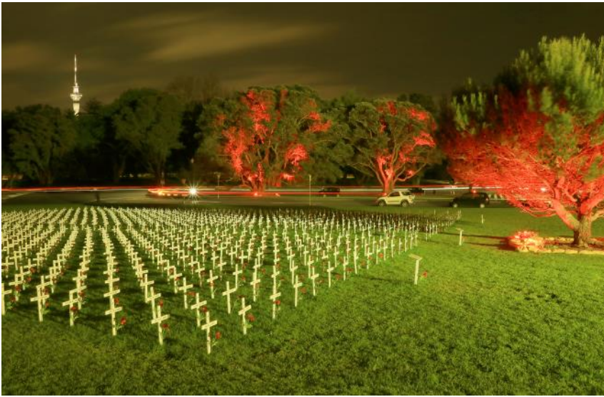
The Fields of Remembrance at the Auckland Domain to Commemorate Armistice Day