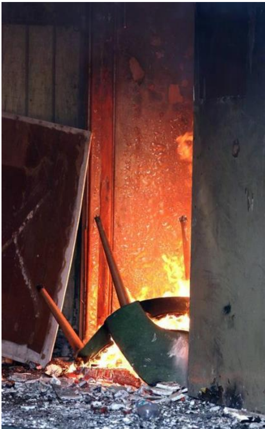
Hot Seat By Barrie Pengelly