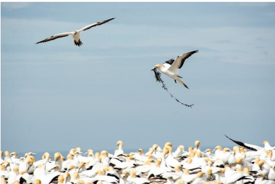
Looking For My Mate