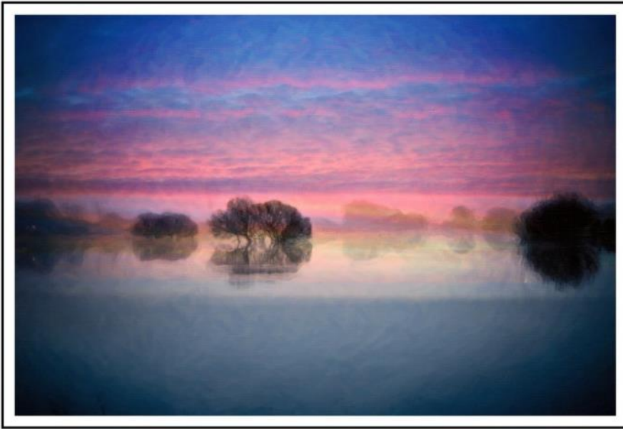
Tree At Mercer