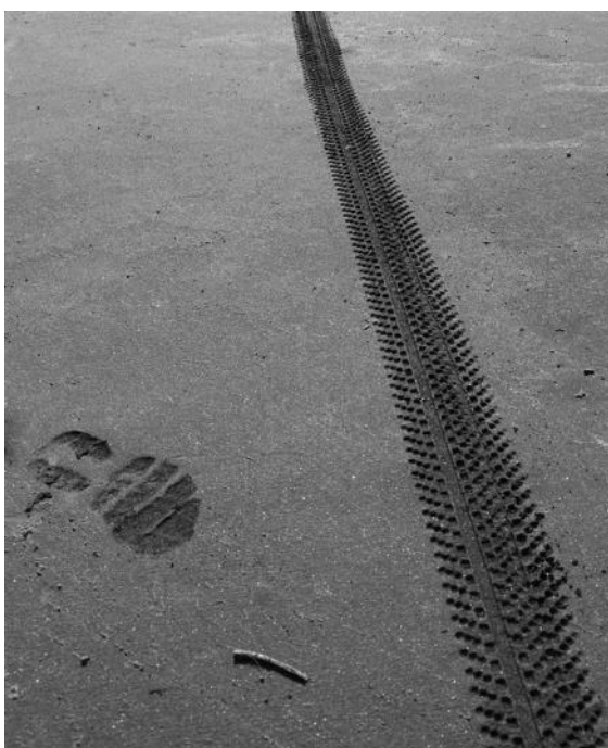
Off Down The Beach