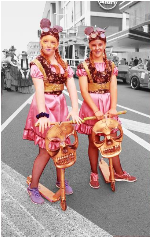
The Steampunk Girls At The Santa Parade