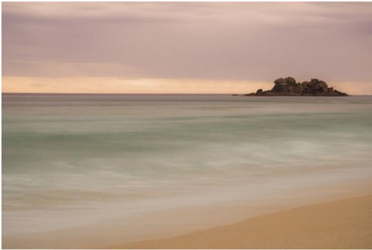
Opoutere Drizzly Sunset Serenity