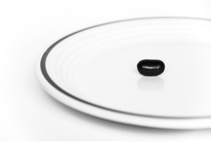
No Title By Stuart Braithwaite