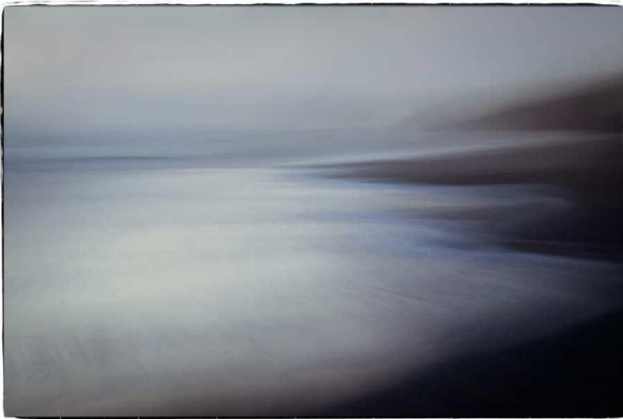
A Silken Sea