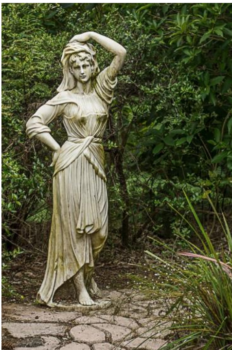
Please Don't Move