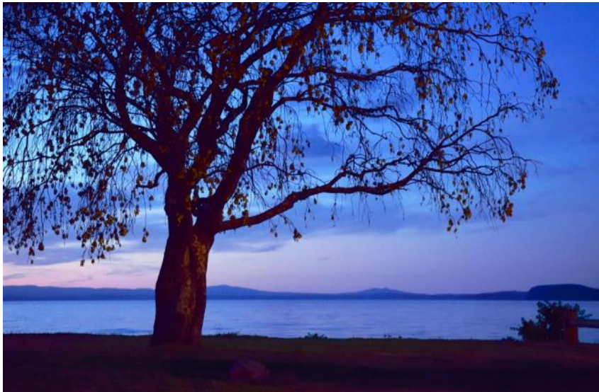
Lake Taupo Kowhai