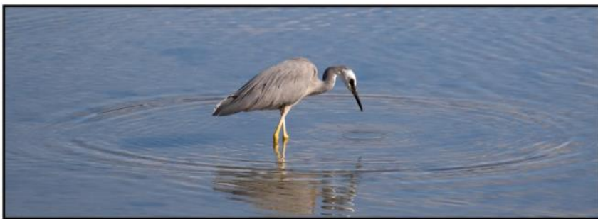
Waiting By Bill Fitzgerald