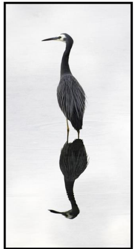
Stillness Of A White Faced Heron