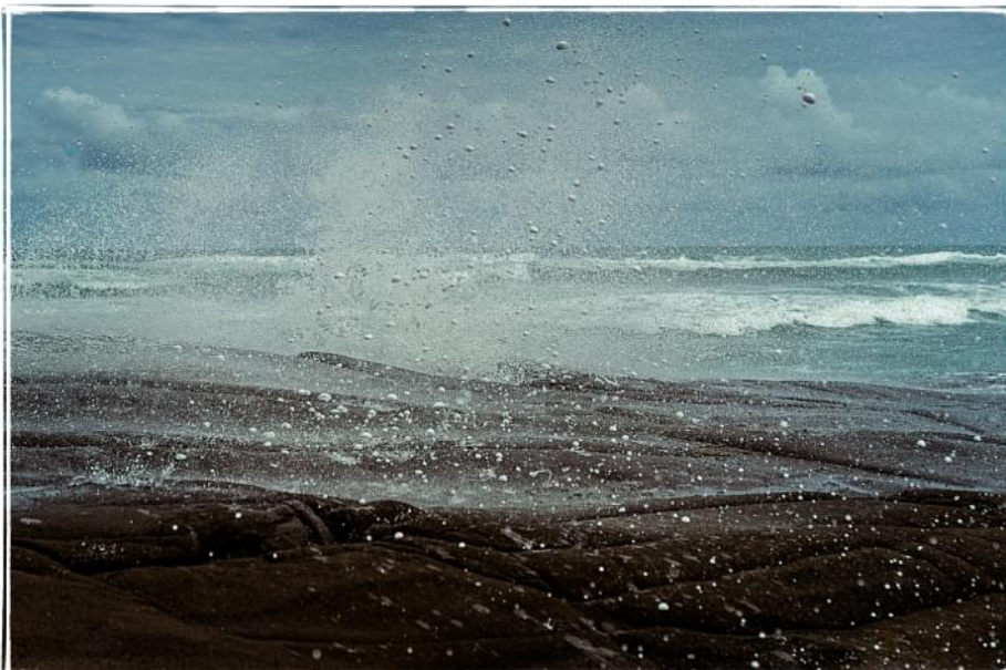
A Bit Too Close