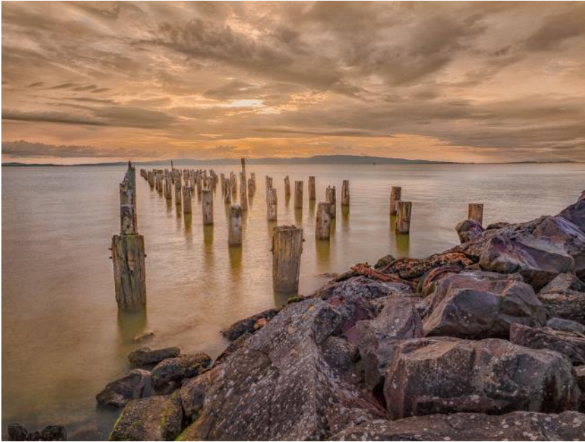
Burke St Wharfe