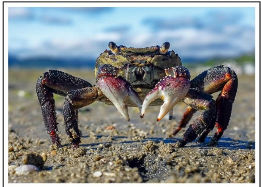
Crab Close Up By Bill Fitzgerald