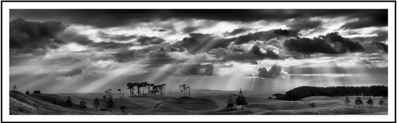
West Coast By Bill Fitzgerald