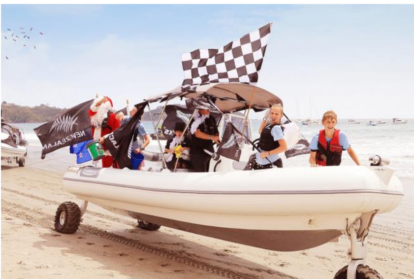
Lollie Scramble on Waiheke