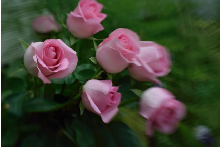
Bunch Of Roses