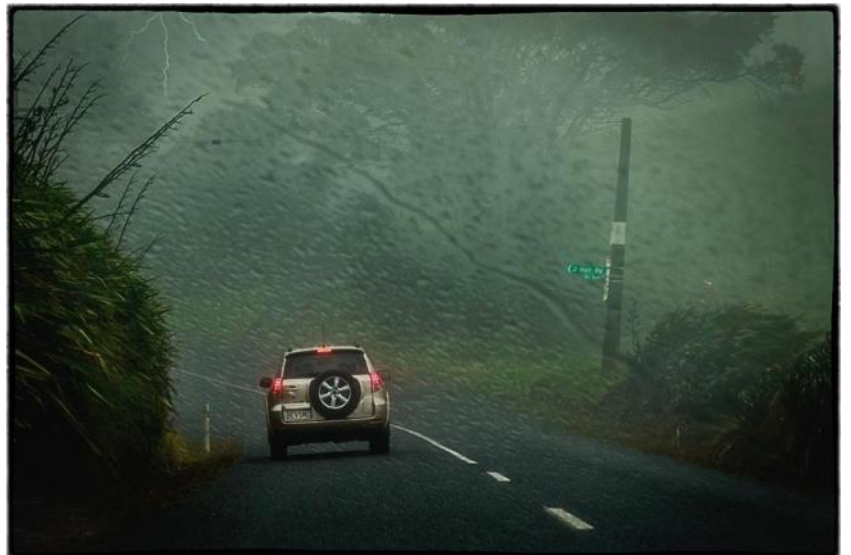
A Miserable Drive