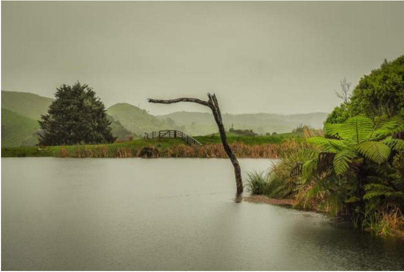
Raindrops On The Pond