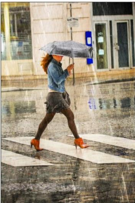
And Then It Rained