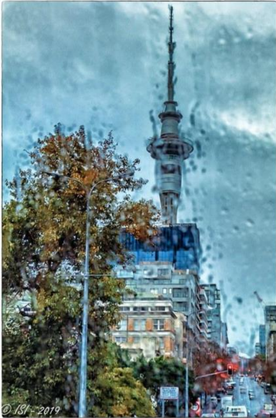
Sky Tower Through A Bus Window