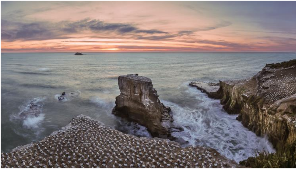
Muriwai (A Pastel Sunset)