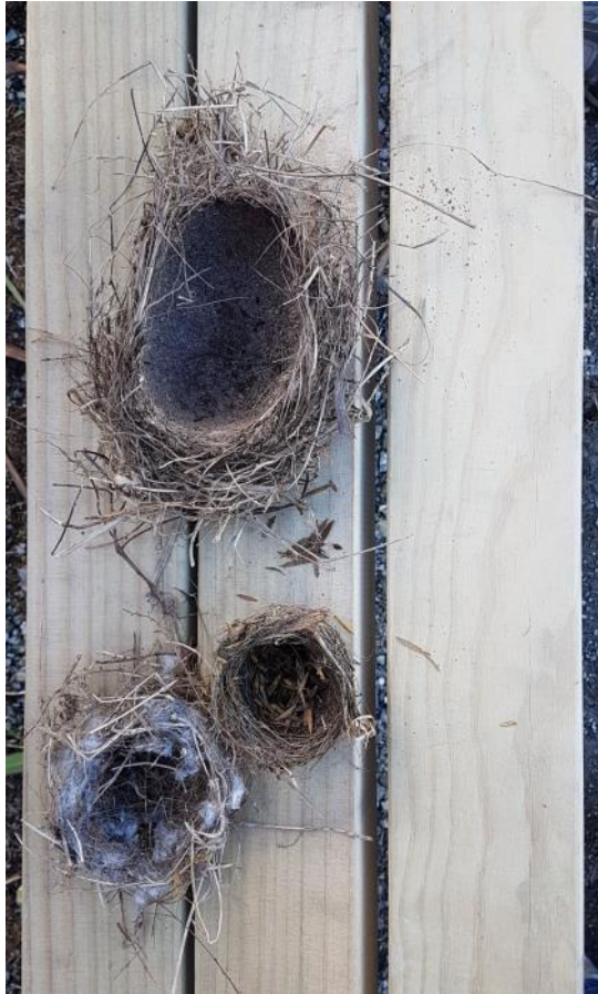
3 Empty Birds Nests On A Park Bench