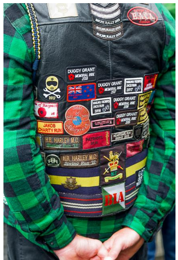
A Bikers Tributes