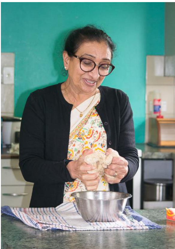
Preparing Japati For The Family