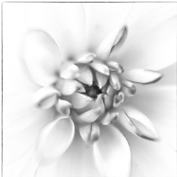
B & W Dahlia Delight