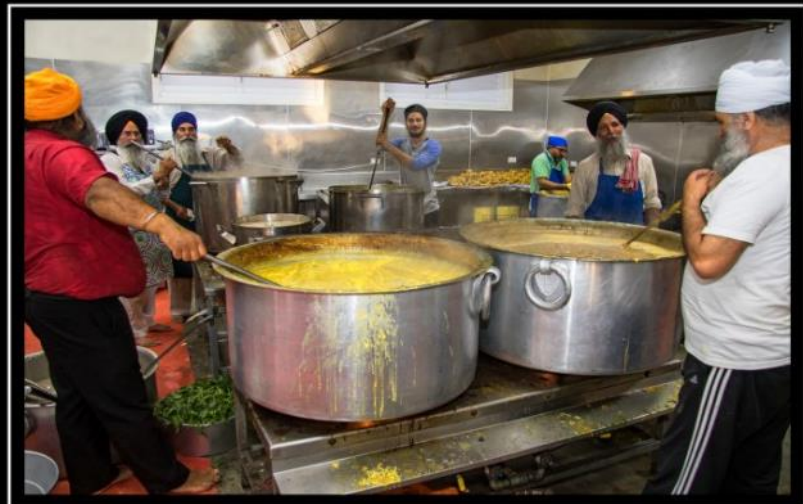
No Shoes Allowed